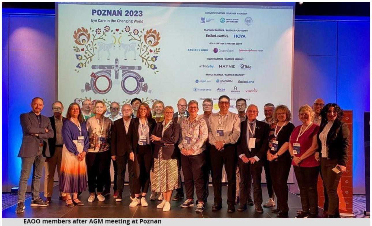
EAOO members after AGM meeting at Poznan

Let us be driven by our shared passion for science and the unwavering belief that resides within each of our hearts. With this determination, we shall find the strength to forge ahead and further advance the EAOO. Together, we will continue to uphold the unity of our professional community, speaking a common language - the language of professionals.